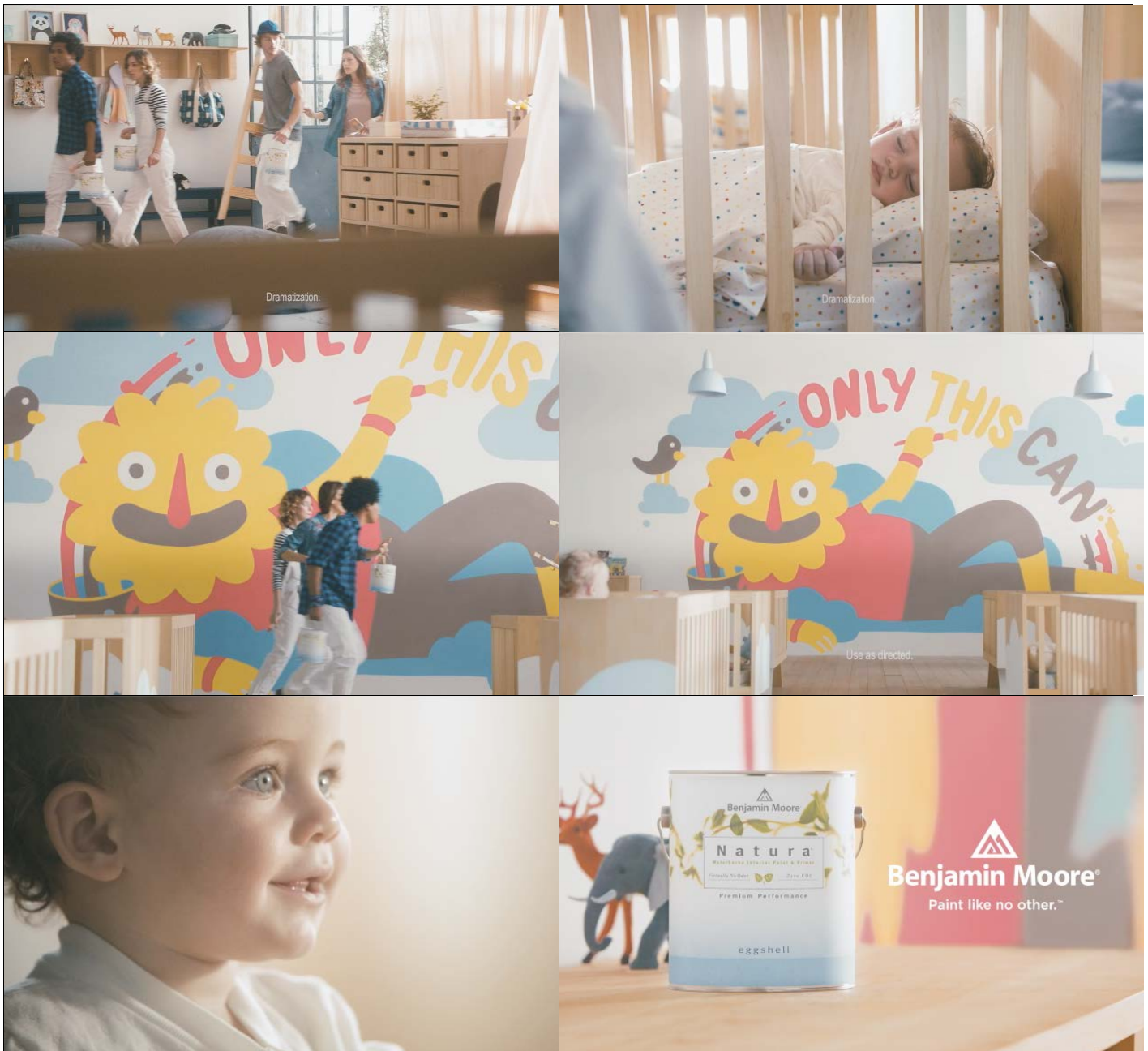
(Exhibit A, screenshots from Benjamin Moore Natura 30-second advertisement).